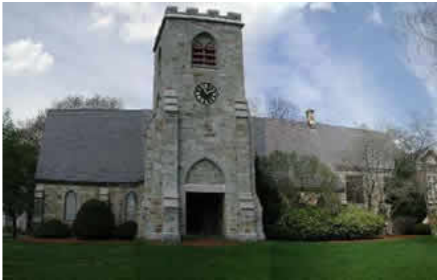
St. Mark's Church, Southborough, Massachusetts